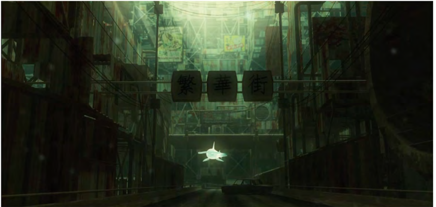
Ann Grim "Beyond The Unknown" 2017

In recent years we have seen an intense and speedy cultural migration and merging of art , architecture and moving image. As empires are built on ruins, so has digital mass evolving from the fractured analogue spectrum of our not so distant past, submerged itself into the fluid fabric of our contemporary worldview.