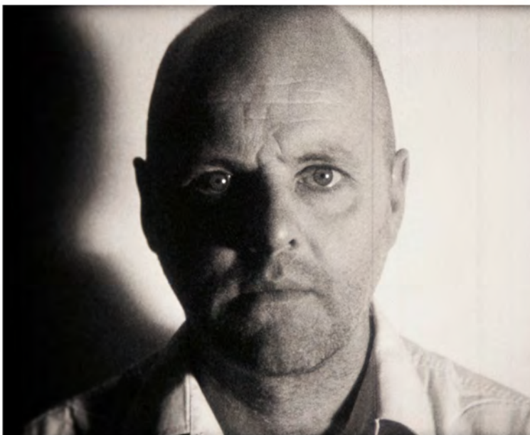
Gavin Turk "Screen Test" 2017

Mash ups, remakes, samplings, cut-ups ; contemporary culture is profoundly fragmented and constantly recreated. What were once avant-garde strategies have now become everyday practices. The ubiquity and diversity of gadgets, cameras and screens is a particularly prominent aspect of this "softwarized" digital culture. Professional film makers are seen to use cheap digital cameras in order to create low tech DIY aesthetics, as exemplified in the Dogme 95 movement initiated by Lars Von Trier and Thomas Vinterberg.